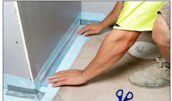
Installing Elastoproof B50 Bond Breaker Joint Band