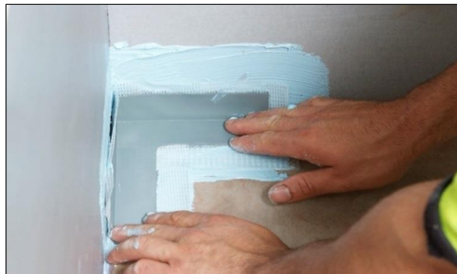
Installing Elastoproof Prefabricated Corners

Measure and cut Elastoproof Joint Band for all wall/floor junction areas. Apply coat of Gripset 51 membrane to extending 150mm up walls and on to floors, and embed Elastoproof Joint Band into wet bed of liquid membrane, ensuring fabric edges are fully wet out and no air bubbles exist behind the fabric. Rear rubber section of Elastoproof Joint Band is not bonded to substrates. At sections where Joint Band is to be joined, a minimum 50mm overlap is required. Elastoproof Prefabricated Corners are available for both internal (90°) and external (270°) junctions, enabling Joint Band to overlap and avoid joint at critical areas. If Prefabricated corners are not used, Elastoproof Joint Band is to have bottom leg cut and folded; ensuring fabric is completely bonded with Gripset 51 membrane.